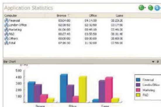
Gather application statistics by department